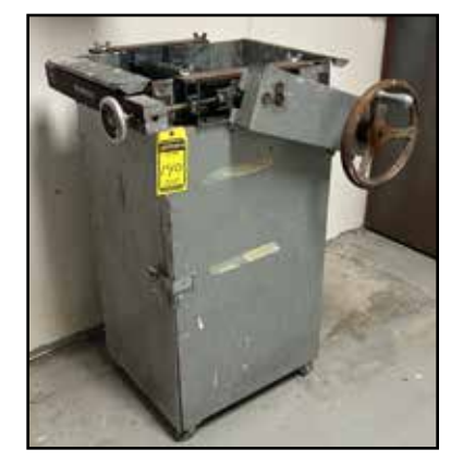
FEATURING : Large Quantity of Stamping Presses, Tool Room, & Material Handling Equipment, Including: (6) Forklifts • (30+) BIG JO Lift Carts & Pallet Jacks • (11) Lathes, Boring Machine • (7) Milling Machines • (4) Surface Grinders • Iron Workers • (4) Press Brakes • (3) Welders • (4) Bandsaws • (15) Drill Presses • (40+) OBI & Punch Presses • (10) Silk Screen Machines • (5) Die Cutting Presses • Uncoiler & Recoilers Ovens • Cooling Tunnel Screen Lines • Trash Compactor • Much More