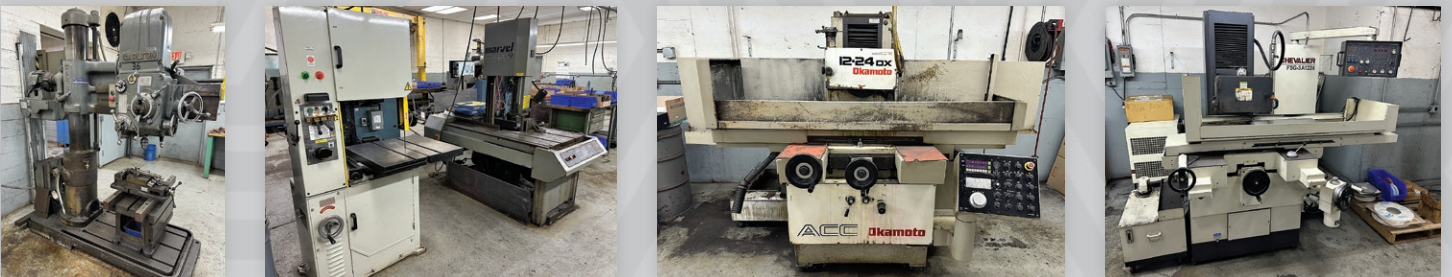
Toolroom Machinery: Lathes, Drills, Grinders, Saws, Welders