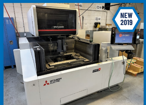
Mitsubishi 2400R EDM