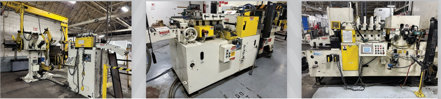
Feed Equipment: Uncoilers, Straighteners, Feeders as New as 2015