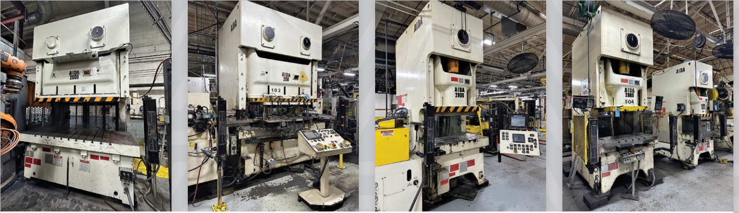
(15+) AIDA Gap Frame Presses from 66 Ton to 220 Ton as New as 2019