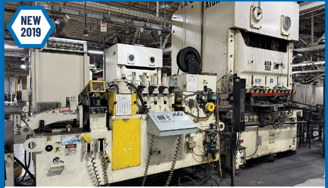
Major Stamping Facility: (15+) Aida Presses & HD Feed Equipment

CIA-INDUSTRIAL.COM 2020 DUNLAP ST. CINCINNATI, OH 45214 513.241.9701