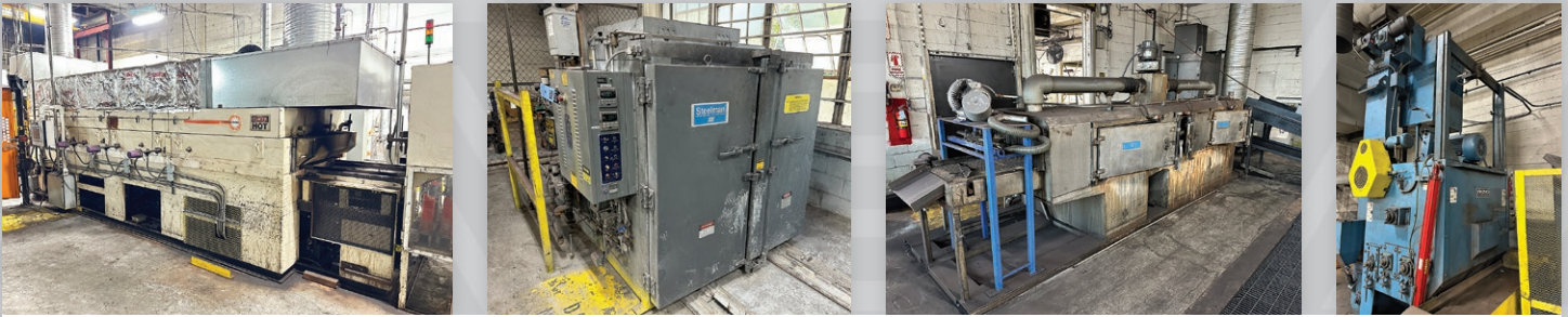
Furnaces, Ovens, Washers & Blasters