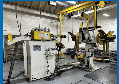
$1M in HD Feed Equipment