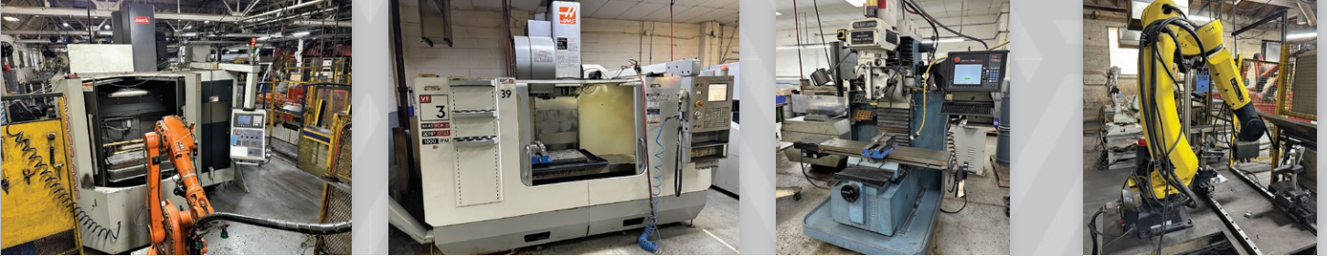
CNC Machinery: VMCs, HMCs, Mills