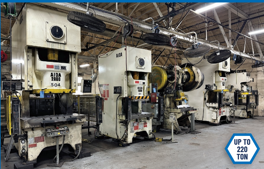
(10+) AIDA Single-Point Gap Frame Presses