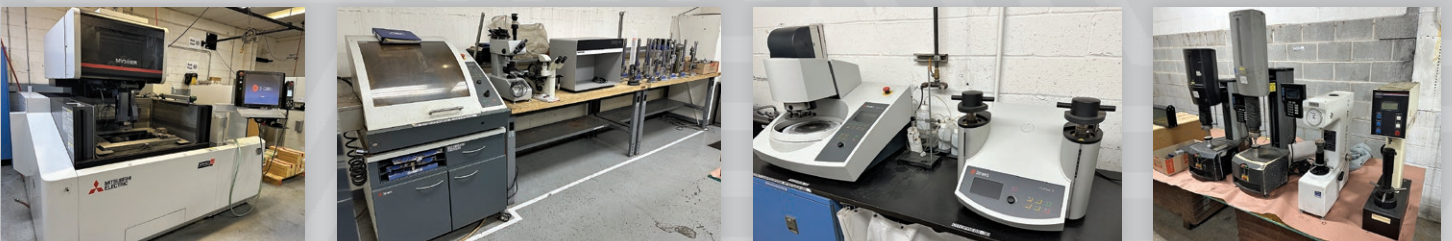
2019 Mitsubishi EDM + Full Service Lab & Inspection Department