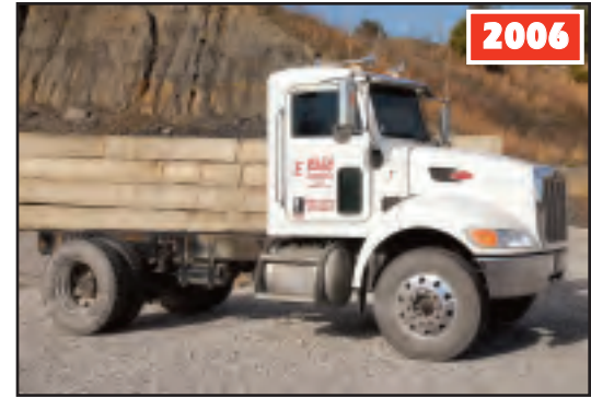
PETERBILT 335 S/A MECHANICS TRUCK