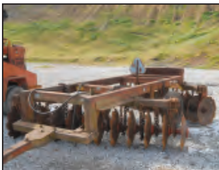
RHINO 116" PULL BEHIND DISC