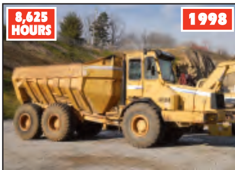
MOXY MT30 S-3 ARTICULATED END DUMP