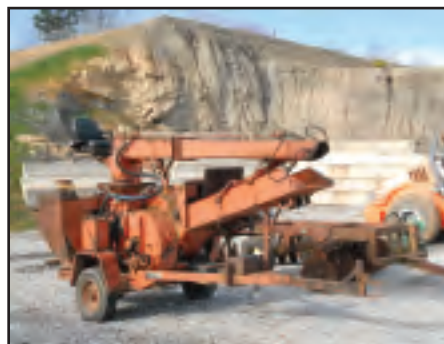
FINN EQUIPMENT MULCH & STRAW BLOWER