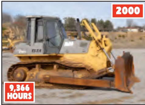
KOMATSU D65EX-12 DOZER