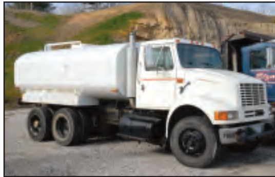
INTERNATIONAL L8100 T/A WATER TRUCK