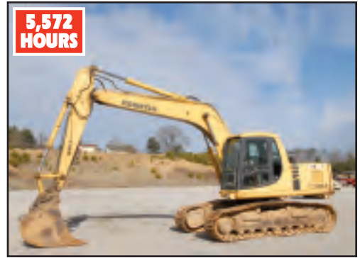
KOMATSU PC150LC-6K EXCAVATOR