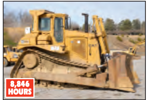
CATERPILLAR D8L DOZER