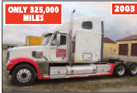
FREIGHTLINER CORONADO TRACTOR

2003 FREIGHTLINER Coronado Sleeper Tractor , Integrated Double Bunk Sleeper, CAT C-15 410 (550) HP Engine, 13-Speed Fuller Transmission, 325,000 Miles, 265"