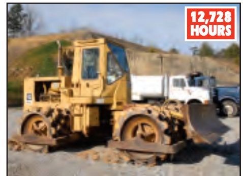
CATERPILLAR 815 SHEEP'S FOOT COMPACTOR

ADVANCE NOTICE EMAILS If you would like to receive advance notice emails before each auction, visit www.myronbowling.com and register.