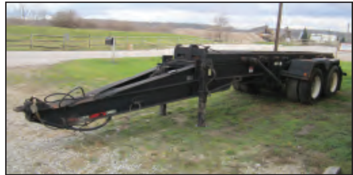
GALBREATH ROLL-OFF TRAILER

INGERSOLL RAND TRAMAC 600 Hydraulic Breaker (disassembled)