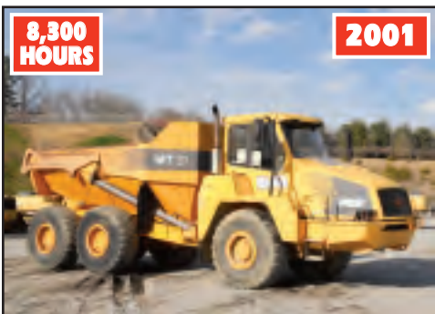
(2) MOXY MT31 ARTICULATED END DUMPS