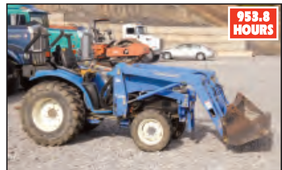
NEW HOLLAND TC29D TRACTOR