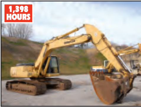
KOMATSU PC220LC-6LE EXCAVATOR