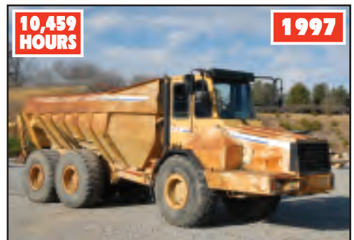
MOXY MT30 S-3 ARTICULATED END DUMP