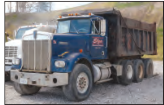
KENWORTH W900A TRI-AXLE DUMP TRUCK

Wheelbase, Air Slide 5th Wheel, 4-Bag Air Ride, 24.5 Aluminum Buds, VIN 1FUJCRAV03PK87838