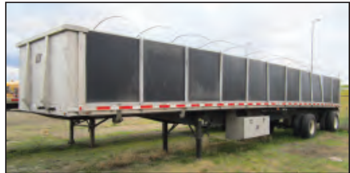
EAST 96" X 45' FLATBED TRAILER

1980 KENWORTH W900A Tri-Axle Dump Truck , w/Air Tag Axle, Eaton Fuller 8-Speed Transmission, CAT 3406 Diesel Engine, 15'-6"/20-Yard Dump Body, 818,000 Miles, VIN 178907S