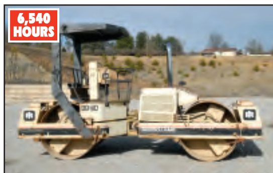
INGERSOLL RAND DD110 DOUBLE DRUM SMOOTH ROLLER

ADVANCE NOTICE EMAILS If you would like to receive advance notice emails before each auction, visit www.myronbowling.com and register.