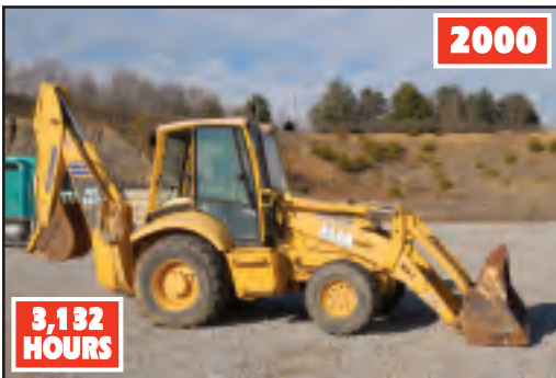
KOMATSU WB140-2 BACKHOE