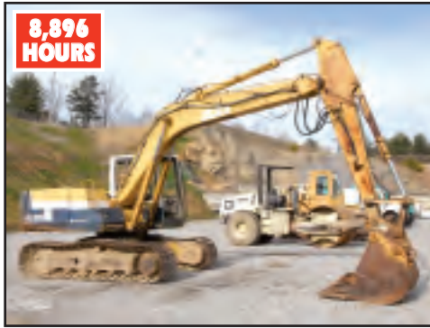
KOMATSU PC150-5 EXCAVATOR