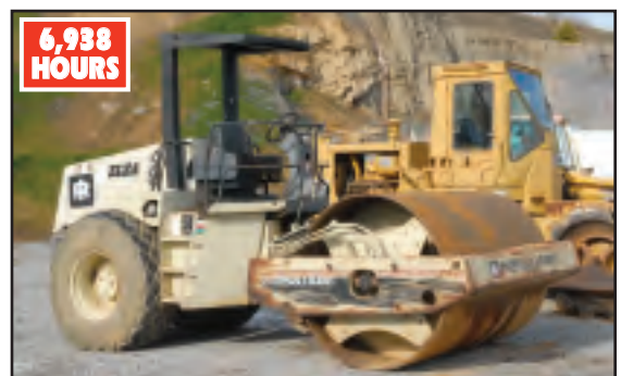
INGERSOLL RAND PRO PAC SD100 SINGLE DRUM SMOOTH ROLLER