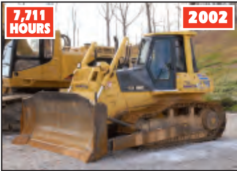
KOMATSU D65EX-12 DOZER