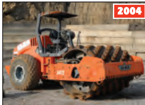
HAMM 3412 SHEEP'S FOOT COMPACTOR